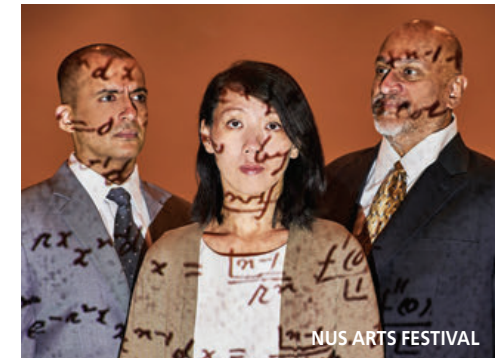
NUS ARTS FESTIVAL