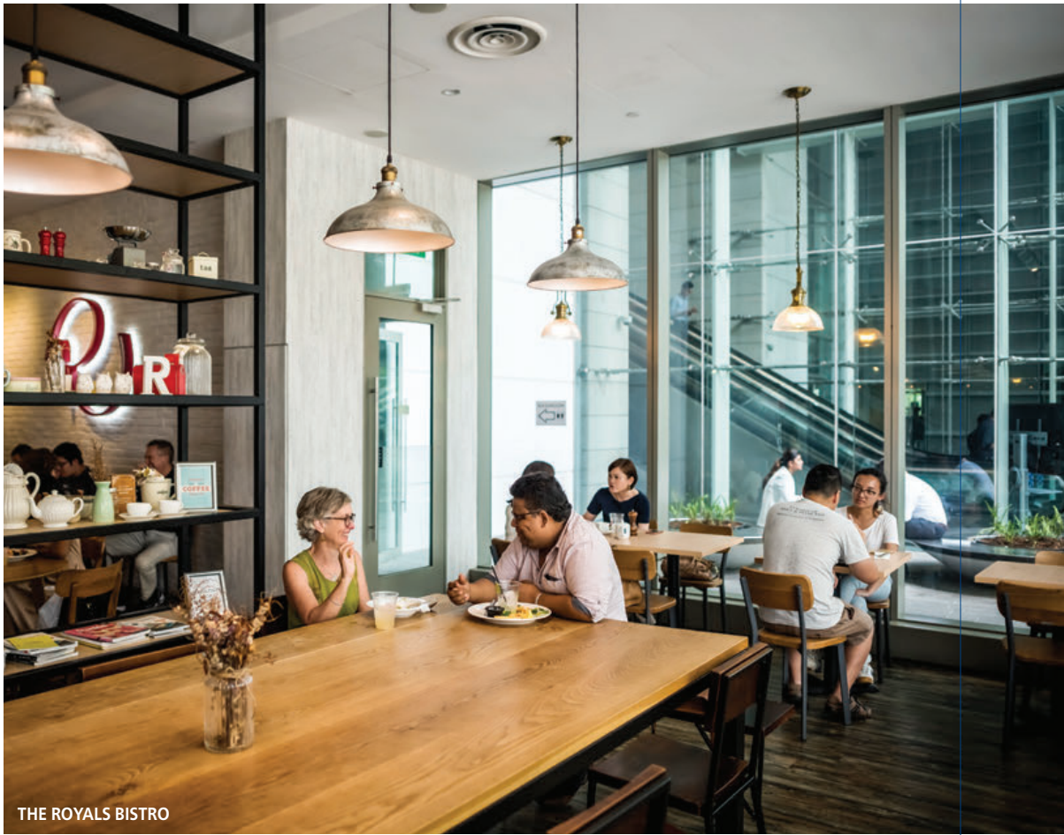
THE ROYALS BISTRO