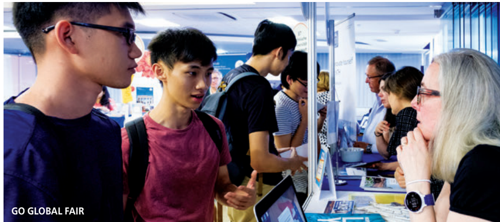
GO GLOBAL FAIR

Interact and network with potential employers to get a head start in your career planning.