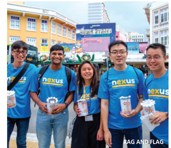
RAG AND FLAG