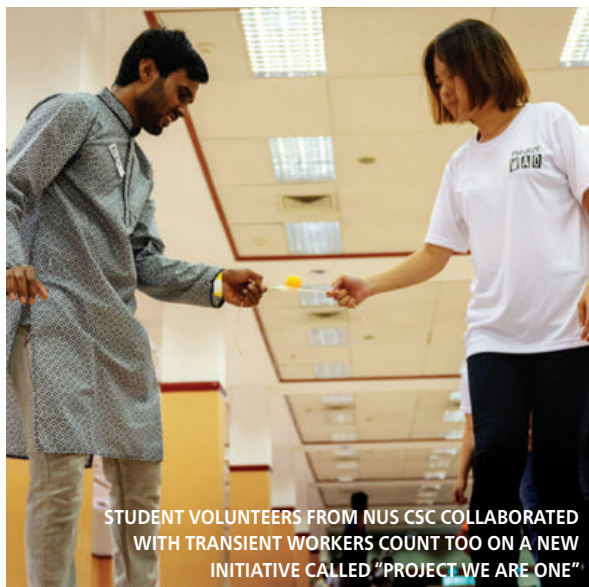
STUDENT VOLUNTEERS FROM NUS CSC COLLABORATED WITH TRANSIENT WORKERS COUNT TOO ON A NEW INITIATIVE CALLED "PROJECT WE ARE ONE"

Established in December 2007, the NUS Volunteer Network comprises the NUS Volunteer Action Committee, Red Cross Youth – NUS Chapter, Rotaract NUS and NUS Students' Community Service Club (CSC). This network seeks to provide a platform to share ideas, experiences and best practices relating to volunteering. It also serves as a platform to provide a wider range of volunteering opportunities to the NUS community.