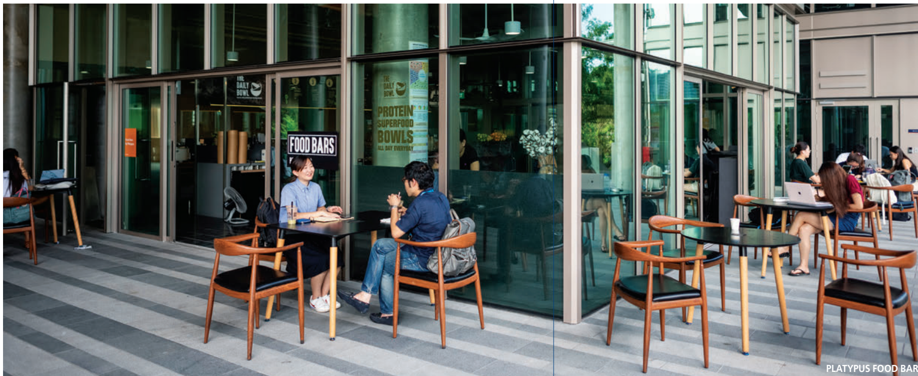
PLATYPUS FOOD BAR