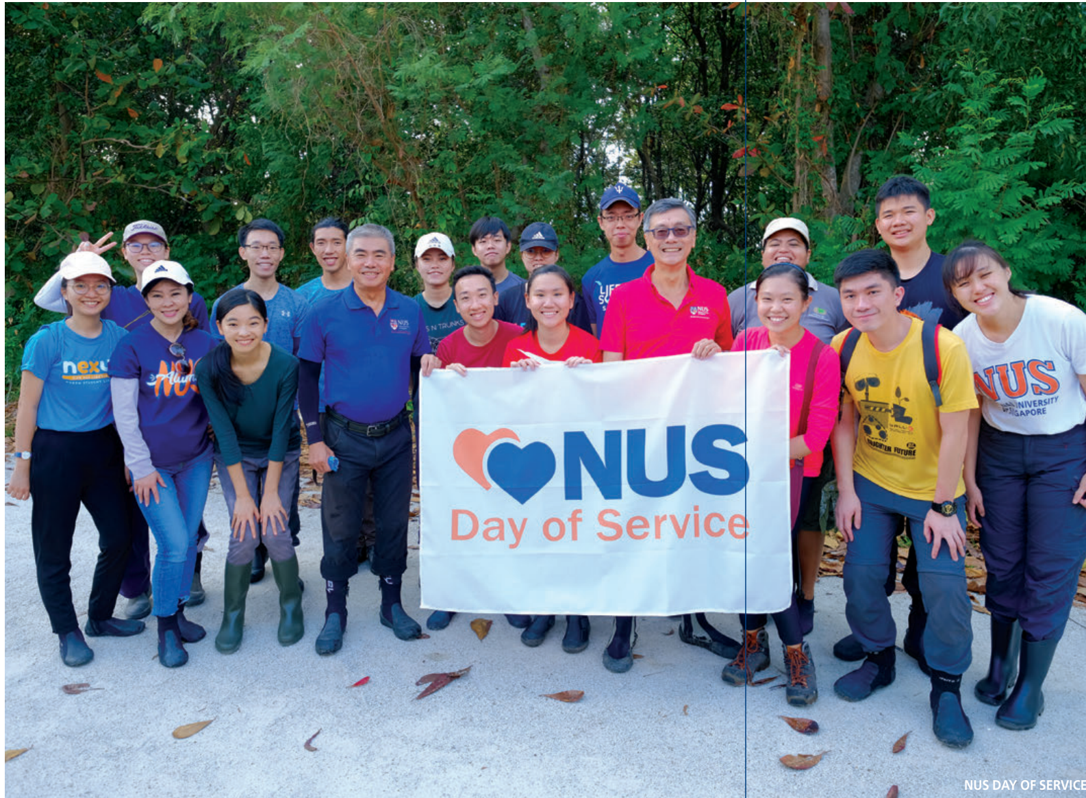
NUS DAY OF SERVICE

T HE University's unstinting support for community service is a tradition instilled by our predecessors more than a century ago. As a student, you can get involved in many student-driven activities to reach out to the less fortunate.