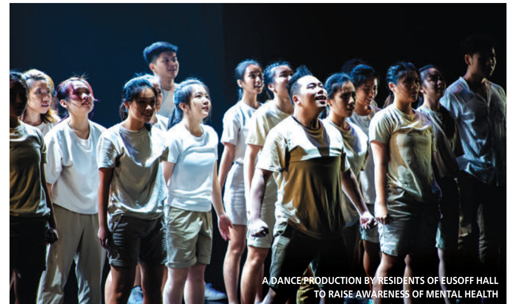
A DANCE PRODUCTION BY RESIDENTS OF EUSOFF HALL TO RAISE AWARENESS OF MENTAL HEALTH