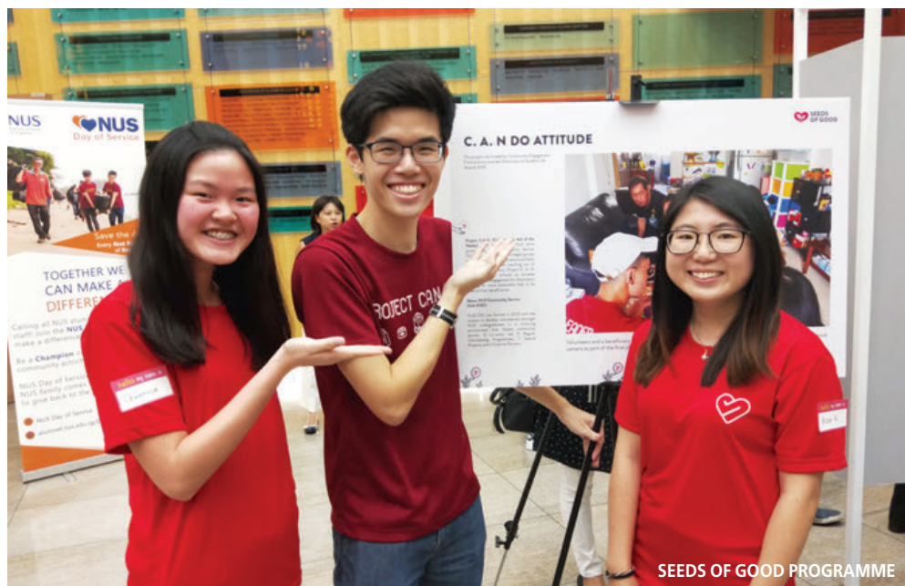
SEEDS OF GOOD PROGRAMME

promote social causes or address issues faced by communities both within NUS and beyond. The student teams have since initiated over 80 projects with community partners of their choice and engaged in activities to enhance the well-being of the community and/or environment.